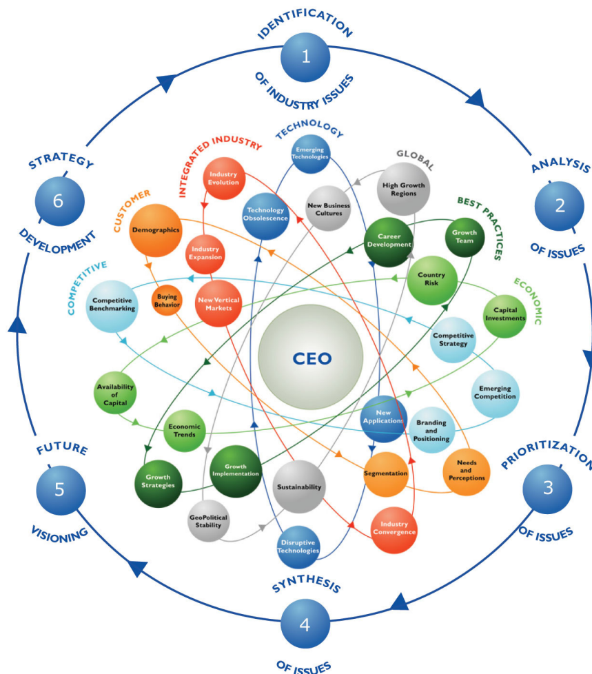
Chart 1: How the CEO's 360-Degree Perspective™ Model Directs Our Research

The CEO 360-Degree Perspective™ model enables our clients to gain a comprehensive, action-oriented understanding of market evolution and its implications for their companies' growth strategies. As illustrated in Chart 1 below, the following six-step process outlines how our researchers and consultants embed the CEO 360-Degree Perspective™ into their analyses and recommendations.